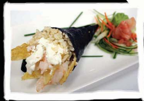
Shrimp tempura & cream cheese