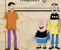
驚心食品 Scary Food